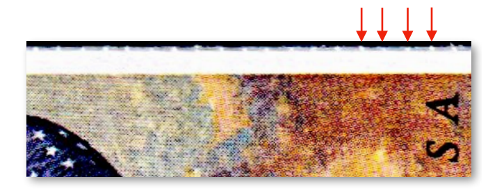
Figure 3. Tiny bridges hold the BCA coils together in a stick. Coils from the inner rows of the web have the bridges on top and bottom. The coils from the outer edges of the web have bridges either on top or the bottom. These are easier to see on stamps that are off their backing

BCA produces the 100-stamp coils in sticks of coils that are as tall as the width of the web. Tiny teeth or "bridges" hold the sticks together, Figure 3. At the post office, the clerk simply snaps the coil off the stick to sell one. The rolls at either end of the stick have the bridges on one side only, with the outer edges being smooth. The APU 100-stamp rolls are individually shrink-wrapped.