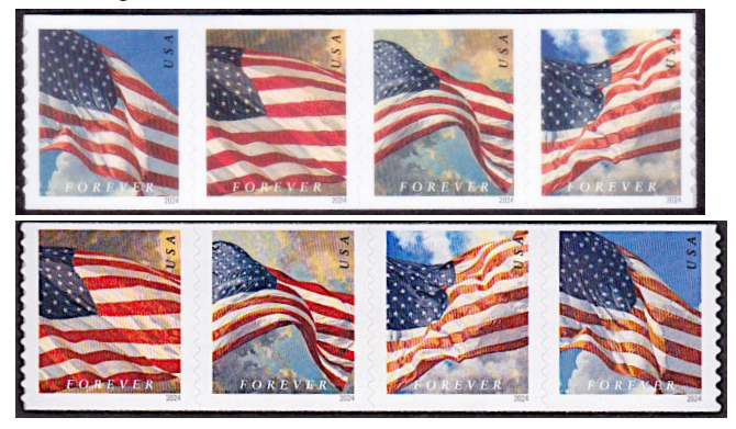
Figure 2. The stamps in the APU 100-stamp coil are narrower than the ones in the BCA coil. This isn't readily apparent in single stamps, but the cumulative effect makes an APU coil shorter than one produced by BCA. The difference is in the vertical margins, wider in the BCA version.